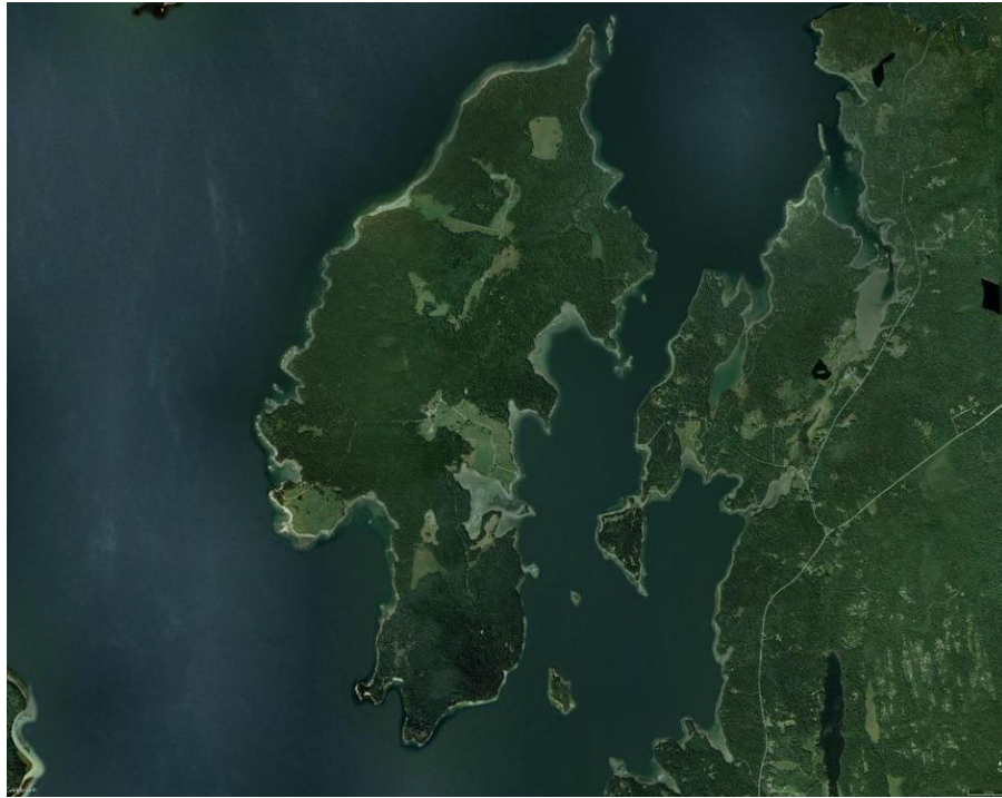
Bartlett's Island, 1996.